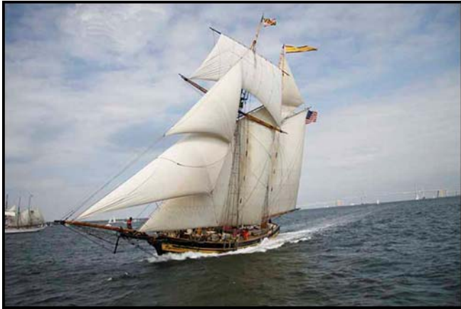
Photo of Pride of Baltimore II